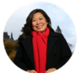
The Honourable Mary Ng, P.C., M.P.

Minister of Small Business and Export Promotion